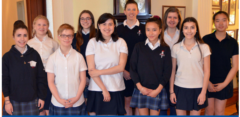
Concours d'Art Oratoire Provincial Competition