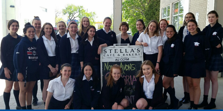
French Dining Experience