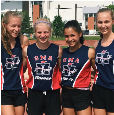
Silver Medalists: Gr 8 Provincial Medley Relay