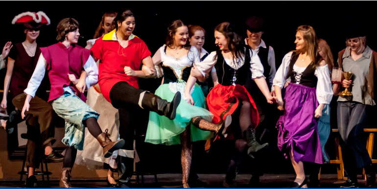
Senior Drama Performance Exam: Disney's Beauty and the Beast, Jr.