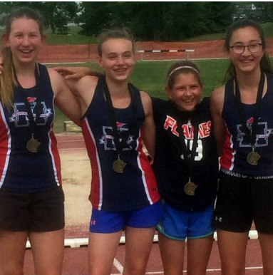
Gold Medalists: Gr 7 Provincial Medley Relay